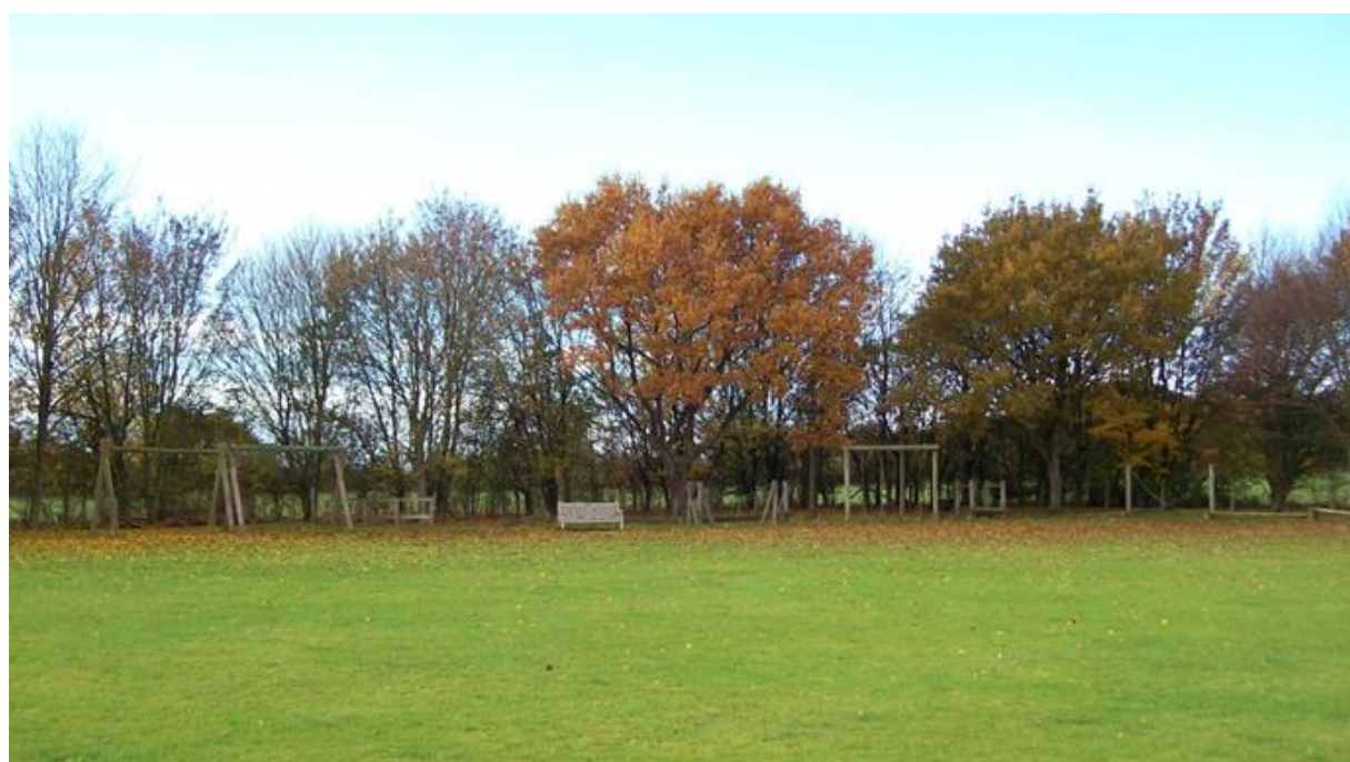
The playground in Leckhampstead Cricket Pitch

When funds allow, it is hoped to extend the equipment provided to include an outdoor gym suitable for use by adults.