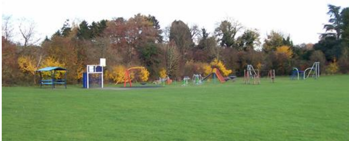
The Playground at Hampstead Norreys Village Hall at the side of the playing field

There are examples locally of playgrounds which are not fenced in, Hampstead Norreys and Lechampstead