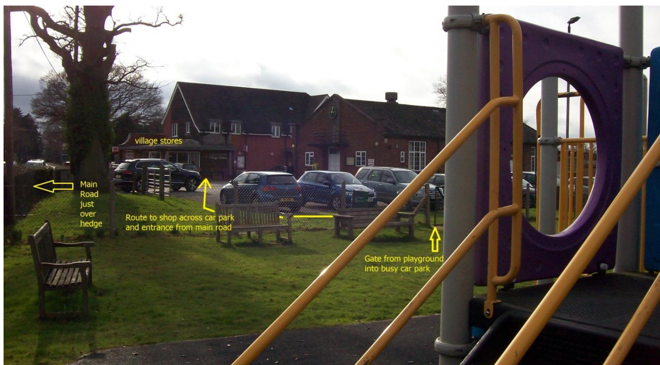
The current playground is accessed through the car park