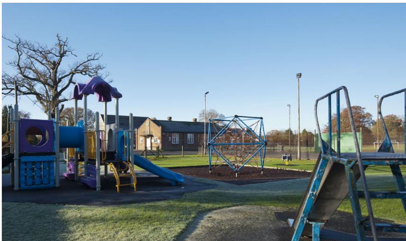
The current playground is need of updating