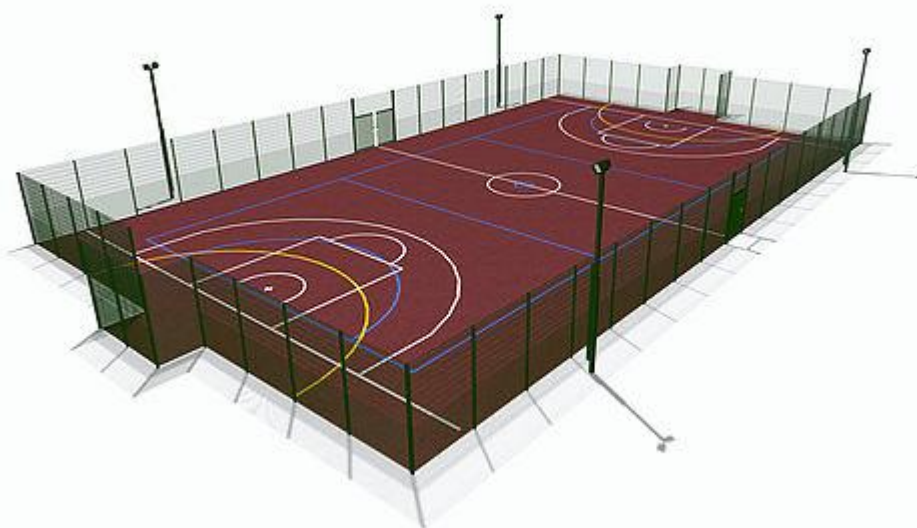
A typical new MUGA

The court is now well passed its best. The court was last resurfaced in around 2007 but currently needs attention. The wire fencing is in a very poor state and the lighting needs replacing. It also suffers from debris and a damp/slippery surface during the winter because of the hedge/overhanging trees lining the site boundary.